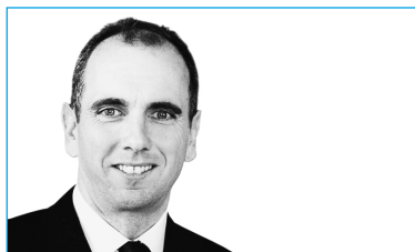
Free cash flow £m